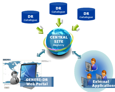
Figure 1 Overview of GENESI-DR

applications via the exposed machine-to-machine interface. The GENESI-DR Web Portal provides data discovery capabilities and access to processing services that make use of high performance Grid-based computing resources to allow for scaling up computing power and storage capacity.